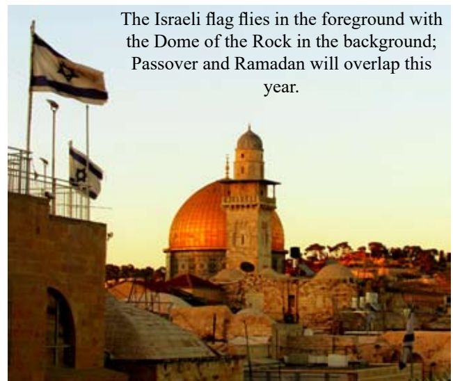
The Israeli flag flies in the foreground with the Dome of the Rock in the background; Passover and Ramadan will overlap this year.